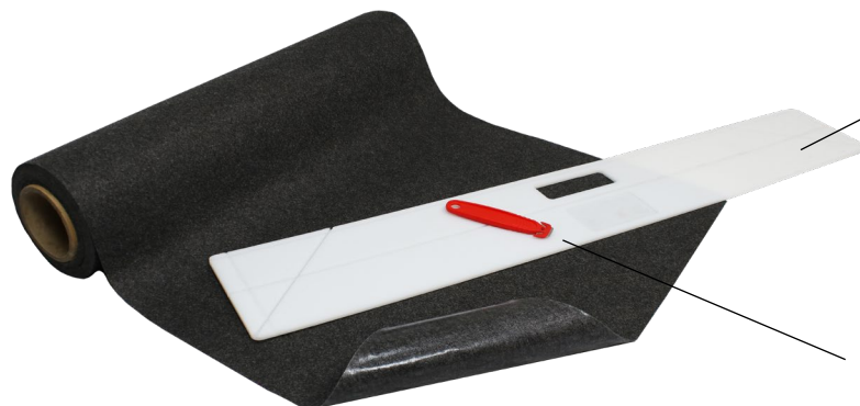
Cutting Board (sold separately)

One cutting knife is included with each roll, additional knives may be purchased separately as well as cutting boards. Individual mats can be cut from the roll as needed.